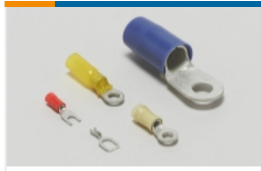
Ring Terminals & Spade Terminals(208)