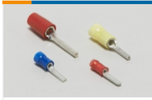
Crimp Wire Pins, Tabs & Ferrules(11)