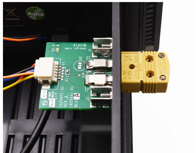
Circuit board and male connector for reference only. Not included with connectors.