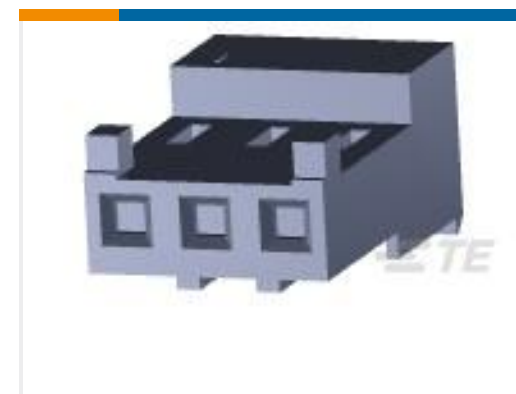
TE Part #3-644463-3 03P MTA156 CONN ASSY 22AWG RED