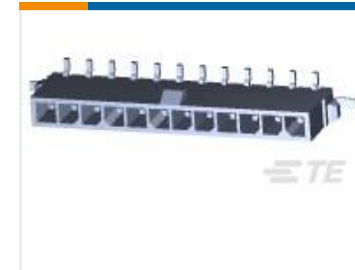
TE Part #3-1445053-2 MICRO MNL HDR ASSY S/ROW LF