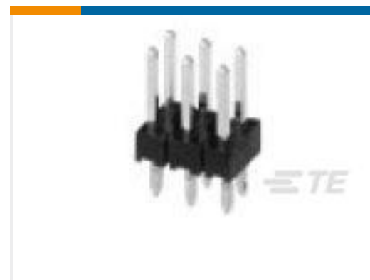
TE Part #104351-3 06 MODII HDR DRST B/A W/HD