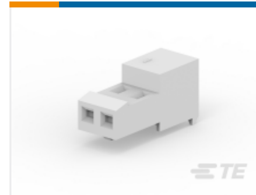
TE Part #5-640440-3 Nylon Tin Plated Receptacle: 2.54mm, No Mating Alignment, MTA 100