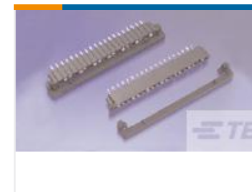
TE Part #5-120628-8 LOCKING TRIOMATE ASY 8P(L)LDLFR