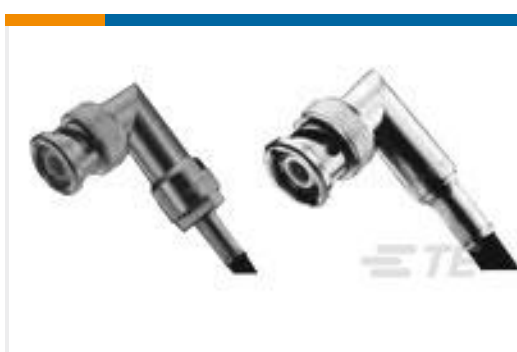
TE Part #5225973-1 PLUG, RT ANGLE, DUAL CRIMP,BNC