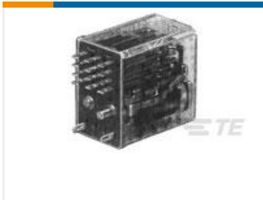
TE Part #4-1393767-4 R10-E2Z4-V15.0K=R10