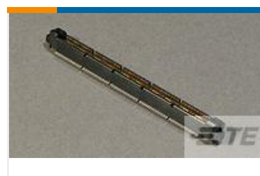
TE Part #767056-5 MICT,260,PLUG,190,ASSY,PDNI