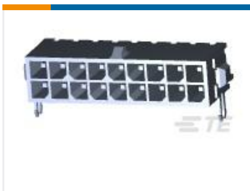
TE Part #4-794625-8 18P MICRO MNL ASSY,R/A,SMT LF