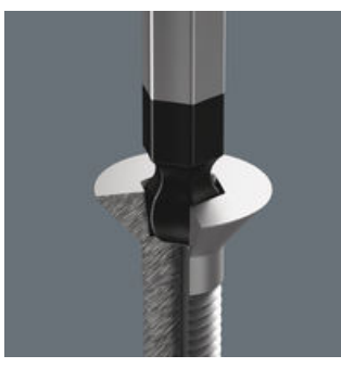
The Wera Black Point tip and a refined hardening process ensure long service life of the tip, improved corrosion protection and an exact fit.