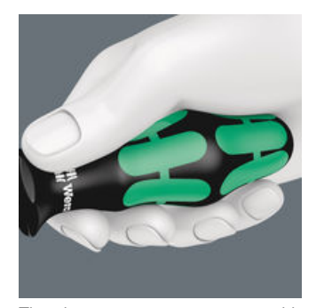
The large contact area – with particularly high friction to the soft zones – results in high torque transfer without any bruising from the edges.