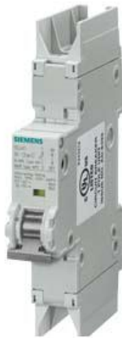
CIRCUIT BREAKER 10KA, 1POLE, D, 30A ACC. TO UL 489 - 277V