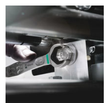
When we began to think about open-ended wrenches, we asked ourselves: why does the wrench always have to be flipped over; why does it have an offset design; why does it slip off injuring fingers? The new design of the mouth resulted in a real "Joker" that works even when all other trumps have been played.