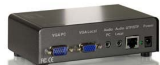
AVE-9201 1-port Cat.5 Audio/Video Broadcaster