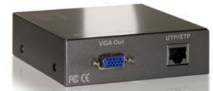
AVE-9200 Cat.5 Audio/Video Receiver

Easy Installation -- With its compact design, our Cat.5 Audio/Video Extender easily fits on a desk or any limited space. No software or interface card is required. You can easily activate this device by simply connecting it to the power source and to the network cable, further saving cable layout and cable installation cost.