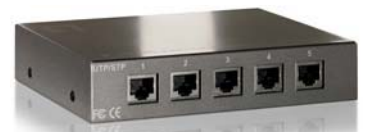
AVE-9205 5-port Cat.5 Audio/Video Broadcaster