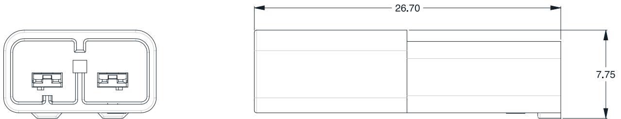
Mated Connector (2271203-1) :