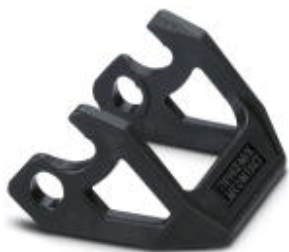
Replacement double locking latch for HEAVYCON EVO housing, HC-B10/HC-B16/HC-B24, PA

Please be informed that the data shown in this PDF Document is generated from our Online Catalog. Please find the complete data in the user's documentation. Our General Terms of Use for Downloads are valid ( http://phoenixcontact.com/download )