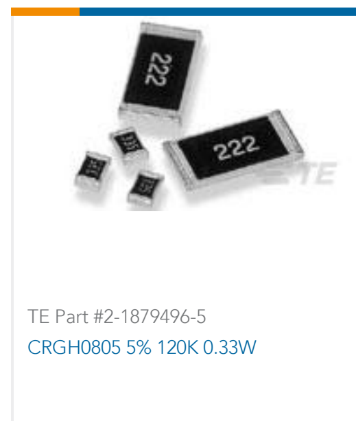
TE Part #2-1879496-5 CRGH0805 5% 120K 0.33W