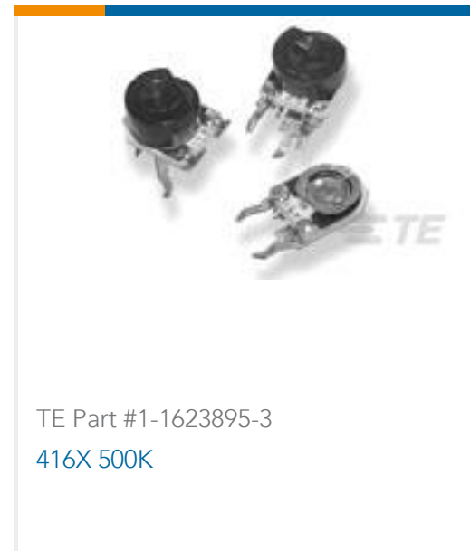
TE Part #1-1623895-3 416X 500K