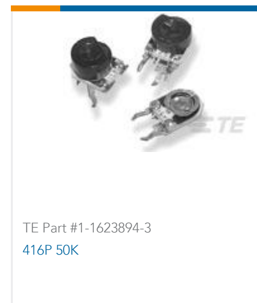
TE Part #1-1623894-3 416P 50K