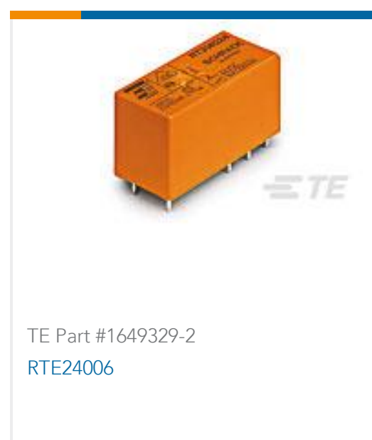
TE Part #1649329-2 RTE24006