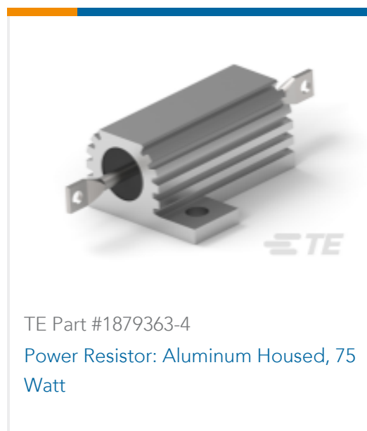
TE Part #1879363-4 Power Resistor: Aluminum Housed, 75 Watt