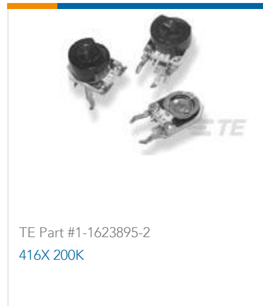
TE Part #1-1623895-2 416X 200K