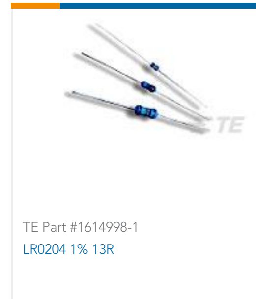
TE Part #1614998-1 LR0204 1% 13R