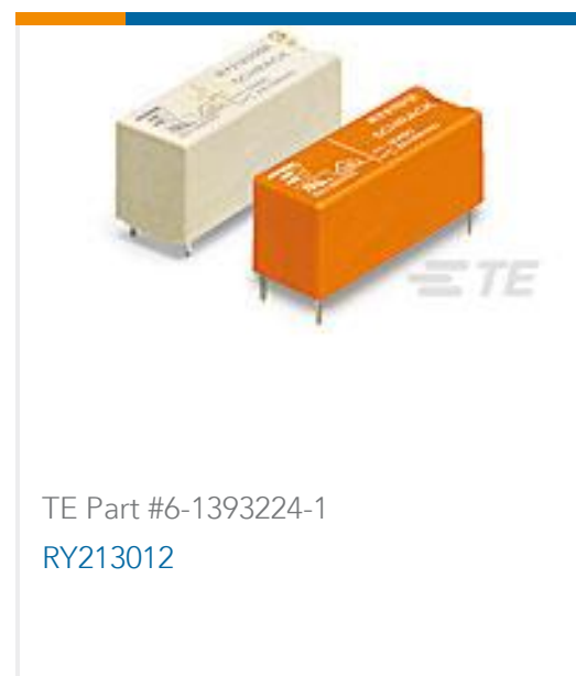
TE Part #6-1393224-1 RY213012