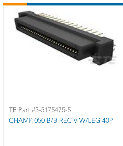
TE Part #3-5175475-5 CHAMP 050 B/B REC V W/LEG 40P BLACK Z