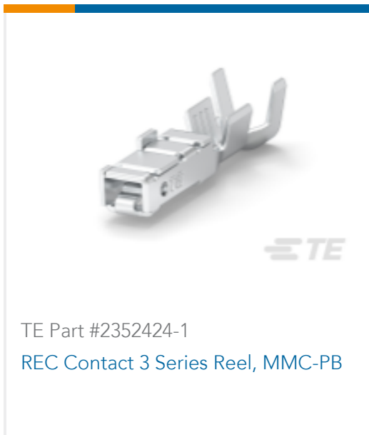
TE Part #2352424-1 REC Contact 3 Series Reel, MMC-PB