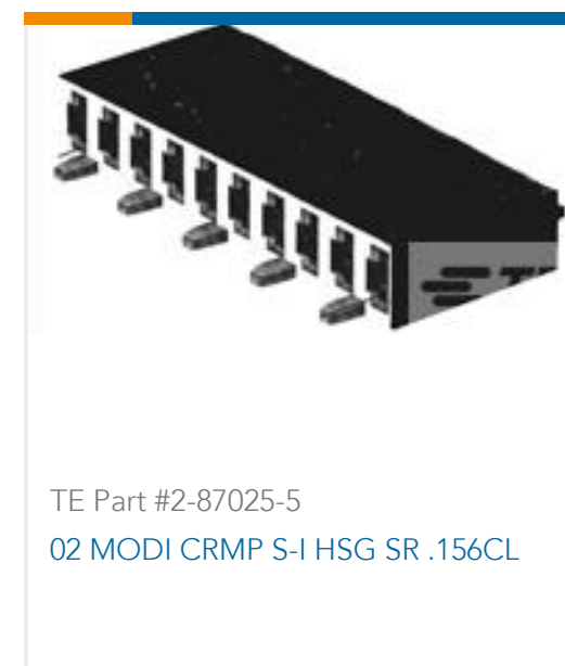
TE Part #2-87025-5 02 MODI CRMP S-I HSG SR .156CL