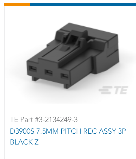
TE Part #3-2134249-3 D3900S 7.5MM PITCH REC ASSY 3P BLACK Z