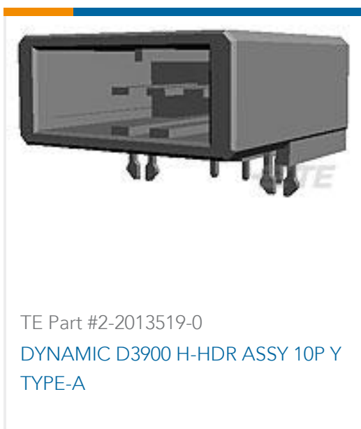
TE Part #2-2013519-0 DYNAMIC D3900 H-HDR ASSY 10P Y TYPE-A