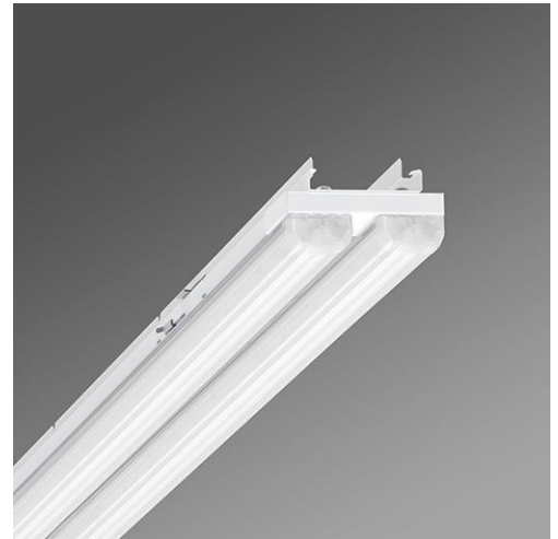
Lighting technology Linear.Lens.Profil-direct narrow distribution SDGLT -2 LED 17000 lm 840