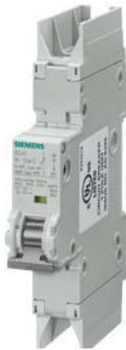
CIRCUIT BREAKER 10KA, 1POLE, C, 20A ACC. TO UL 489 - 277V