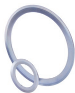
Flanges page 198