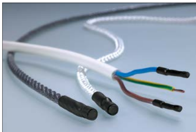
The appropriate end cap for every cable diameter, and cable types.