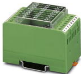
Diode module, with 8 diodes, individually wired, diode type 1N 4007

Please be informed that the data shown in this PDF Document is generated from our Online Catalog. Please find the complete data in the user's documentation. Our General Terms of Use for Downloads are valid ( http://phoenixcontact.com/download )