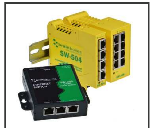
SW Range Switch products available in a range of formats and specifications. www.brainboxes.com