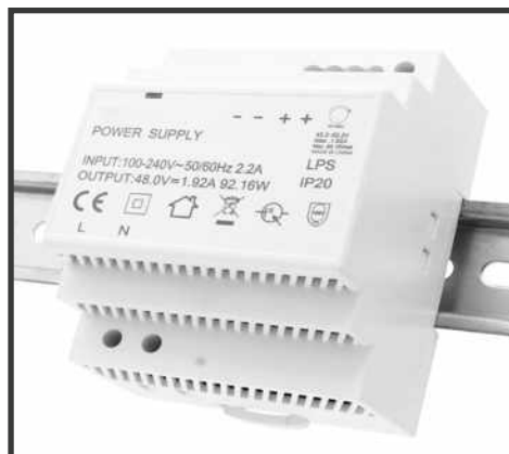
PW-301 DIN Rail Power Supply