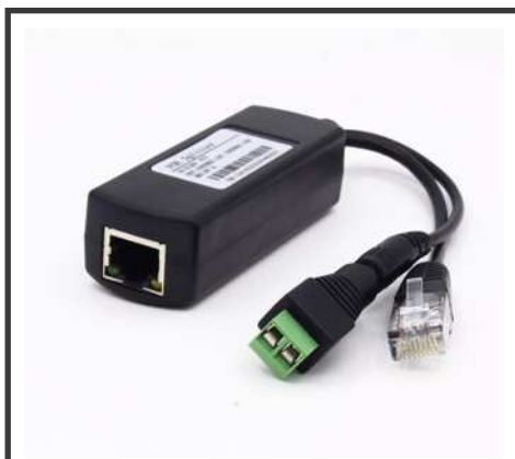
PW-323 PoE Splitter