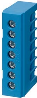
ALPHA-ZS, N terminal, 7-pole 7x 16 mm 2 , blue