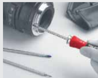
Convincing variety and quality. SYSTEM 4 – a real multi-tasker.

We offer SYSTEM 4 sets in compact roll-up pouches, rigid metal and easy access plastic boxes.