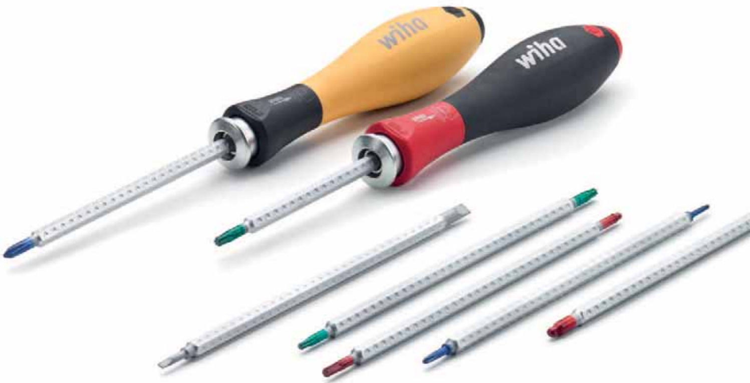
Colour-coded ChromTop® tips for maximum clarity.

Due to its versatility and quality the Wiha SYSTEM 4 is a reversible blade system that convinces every user.