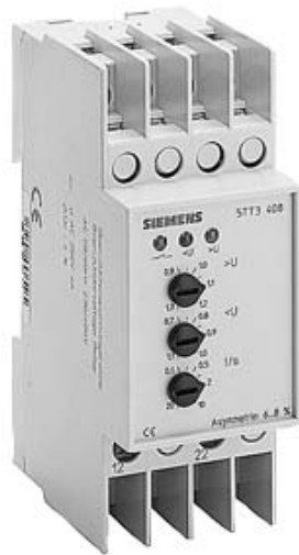
VOLTAGE RELAY, N-TYPE AC 230/400V 2CO 0.9/1.3+0.7/1.1