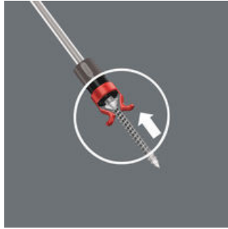
And this is how the gripper works

Attach the screw to the tip of the blade and secure it in the gripper.