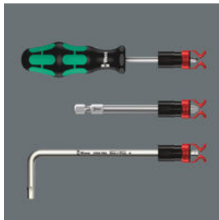
And this is how the gripper works

The screw gripper attachment can also be used with L-keys and long bits!