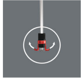
And this is how the gripper works

The two gripper arms spread further apart as they are pushed against the surface and automatically snap back when the head of the screw is countersunk.