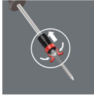
And this is how the gripper works

Pull the screw gripper towards the screwdriver handle until the two arms of the gripper sit against the head of the screw and are spread slightly apart. The Wera screw gripper releases the screw automatically after it has been fastened.