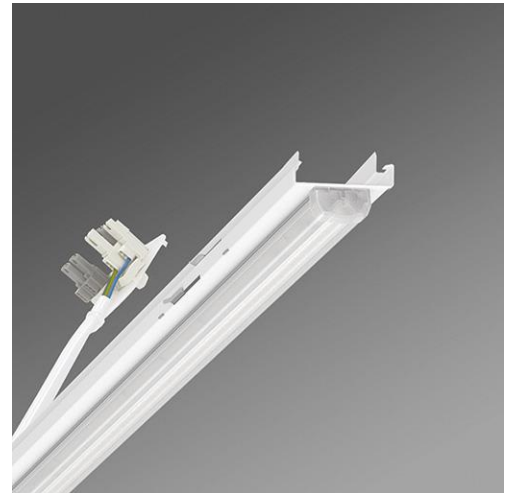
Lighting technology Linear.Lens.Profil-direct narrow distribution SDGVLT LED 10000 lm 840