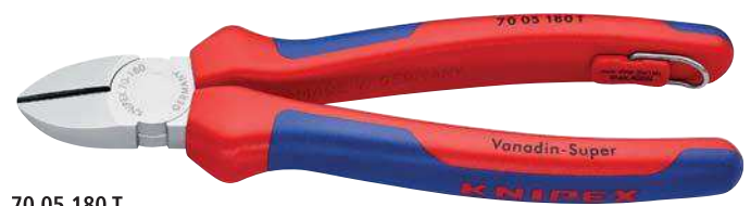
70 05 180 T