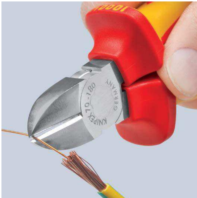
Clean cutting of thin copper wires, also at the cutting-edge tips

Pliers with tether attachment point for mounting a fall protection