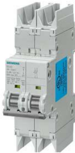
CIRCUIT BREAKER 10KA, 2POLE, C, 20A ACC. TO UL 489 - 480Y/277V