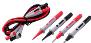
U1169A Test Probe Leads

Includes two test leads (red and black), and a pair each of 19-mm and 4-mm test probes.