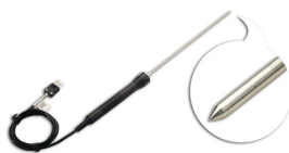
U1181A Immersion Temperature Probe