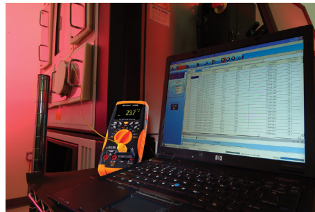
Figure 1. Automate recording of measurements with bundled GUI data-logging software.

Offering the same functionality as the U1252B, the U1253B is the world's first OLED handheld DMM. You won't have to squint to be sure you're reading it right: On the go or on the bench, you'll get crystal-clear viewing indoors, even in dark, off-angle situations.