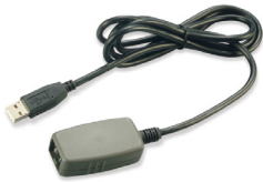
U1173A IR-to-USB Cable