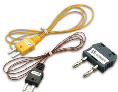
U1180A Thermocouple Adapter+Lead Kit, J and K Types

Includes thermocouple adapter, thermocouple bead J-type and thermocouple bead K-type.