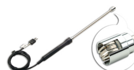
U1182A Industrial Surface Temperature Probe