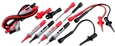
U1168A Standard Test Lead Kit

Includes two test leads (red and black), 19-mm and 4-mm test probes, alligator clips, fine-tip test probes, SMT grabbers and mini grabber (black).