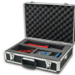
U1172A Transit Case (Aluminium-clad)