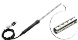
U1183A Air Temperature Probe