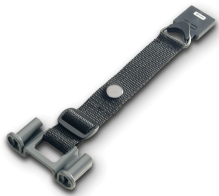
U1171A Magnetic Hanging Kit

For fastening of DMM to a steel surface so both hands are free.