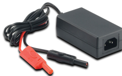
U1170A AC Adaptor