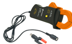
U1583B AC Current Clamp