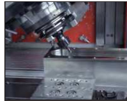
Machine & Equipment