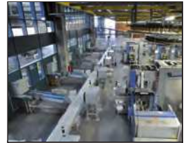
Warehouse & Distribution