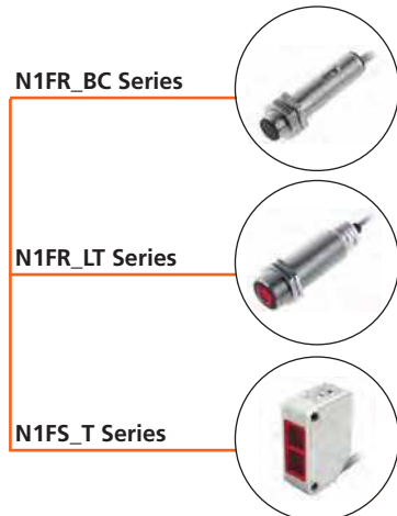
Photo Electric Sensors