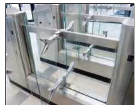
Doors & Elevators