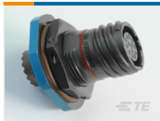
TE Part # CAT-D38999-DTS13E D38999 Connectors: Jam Nut, 11-98 Insert