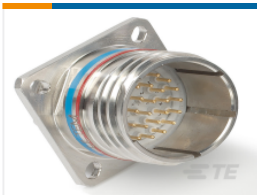
TE Part # CAT-D38999-DTS4Q D38999: Square Flange, 11-98 insert