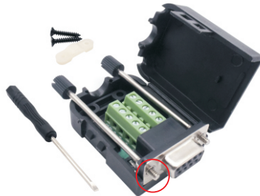
2010C247 - Female connector with locking screw connection