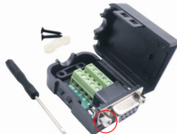
2010C249 - Female connector with jackscrew nut connection

Included accessories 1x Screw driver 1x Cable strain Relief 2x Fastening screw