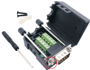
2010C246 - Male connector with locking screw connection