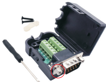
2010C248 - Male connector with jackscrew nut connection