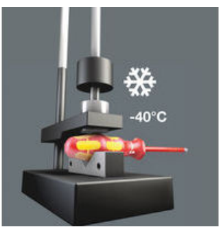
Impact strength tested at -40^{\circ} C, guaranteeing safety even under extreme conditions.