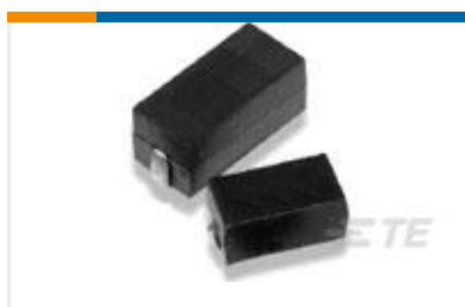
TE Part #1879233-4 SMW5 R13 5%