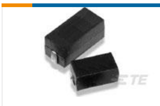
TE Part #1879235-5 SMW5 R15 1%