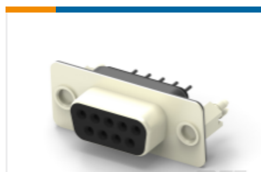
TE Part #2301838-1 AMPL REC HD20, VERT, 9P, B/L,4-40 INS