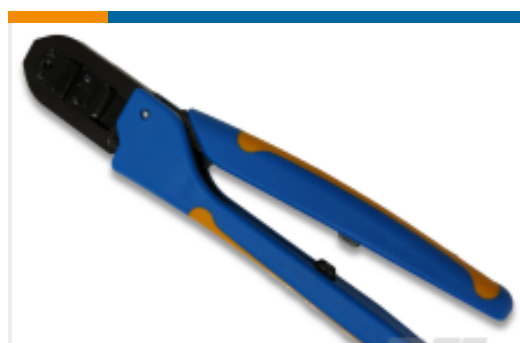
TE Part #1729069-1 SAHT MINI CT 28-24 ASSY