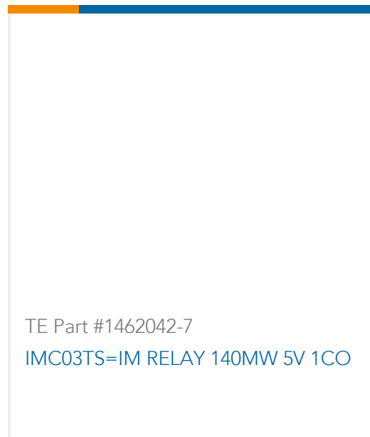
TE Part #1462042-7 IMC03TS=IM RELAY 140MW 5V 1CO