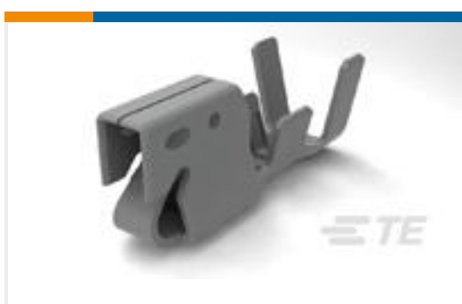
TE Part #1744201-1 EP-II CONTACT LANCELESS, 20-16