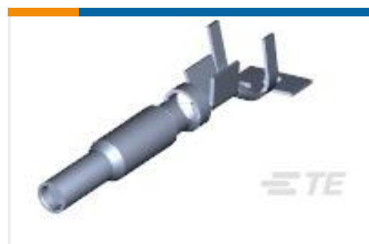
TE Part #770006-3 UMNL II SOK PTPPHBZ