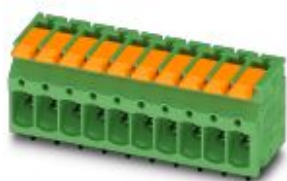
The figure shows an 10-position version

Please be informed that the data shown in this PDF Document is generated from our Online Catalog. Please find the complete data in the user's documentation. Our General Terms of Use for Downloads are valid ( http://phoenixcontact.com/download )