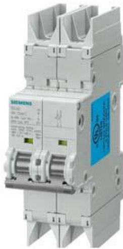
CIRCUIT BREAKER 10KA, 2POLE, C, 16A ACC. TO UL 489 - 480Y/277V