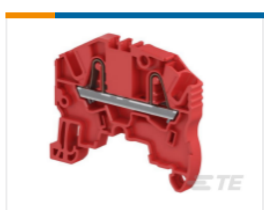
TE Model / Part #1SNK705062R0000 ZK2.5-RD