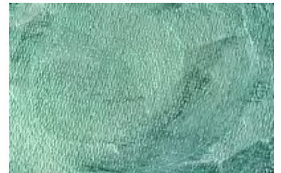
Shimmering Green 714