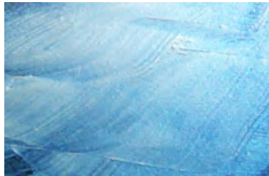
Shimmering Blue 711