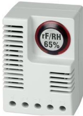
ELECTRONIC HUMIDISTAT EFR012 230 V AC, 65 %RH FIXED