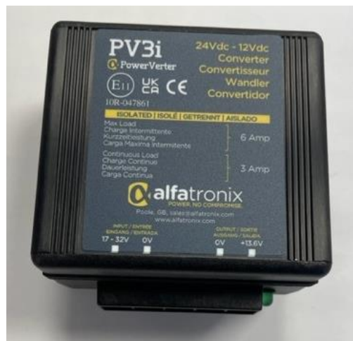
Typical Isolated unit now without grounding lead