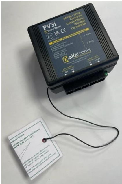
With grounding lead