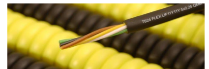
Photographs are for illustrative purposes only

Cable type : LiF11Y11Y 5x0,50 mm 2 TB24 FLEX Stranding : 128x0,07 mm bare copper wires Conductor insulation : PUR Conductor colours : according to DIN 47100 Overall sheath : PUR Colour : black (dull) Temperature range : -30 °C to +80 °C