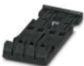
Strain relief, Number of positions: 4, Color: black