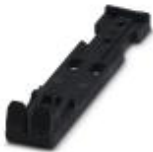
Strain relief, Number of positions: 2, Color: black