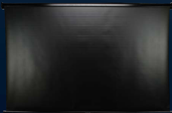
Black-Backed Screen Material

Elite Screens stocks all sizes from 71" to 170" in 1:1, 4:3, 16:9 and 16:10 aspect ratios. Choose from white or black metallic casing options.