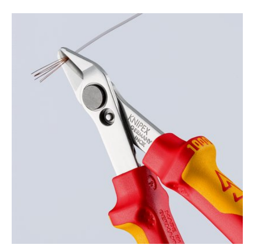
For use on live parts of up to 1000 V