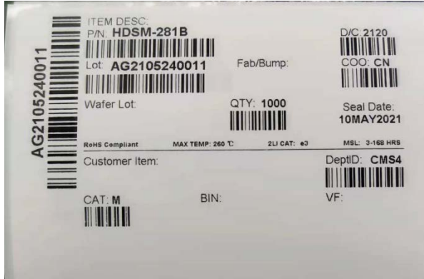
Label for current dice