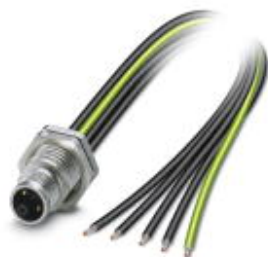
Flush-type connector, Power, 5-position, Plug, M12, K - Power, Rear mounting, M16 x 1.5, Individual wires, cable length: 0.2 m

Please be informed that the data shown in this PDF Document is generated from our Online Catalog. Please find the complete data in the user's documentation. Our General Terms of Use for Downloads are valid ( http://phoenixcontact.com/download )