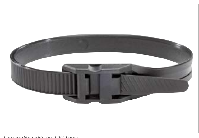
Low profile cable tie, LPH-Series.

• Parallel bundling for secure applications