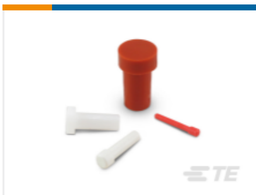
TE Part #114017-ZZ DEUTSCH SEALING PLUGS