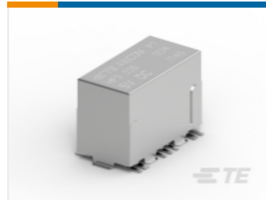
TE Part #2-1462050-2 AXICOM HF RELAY 3GHZ SHIELDED