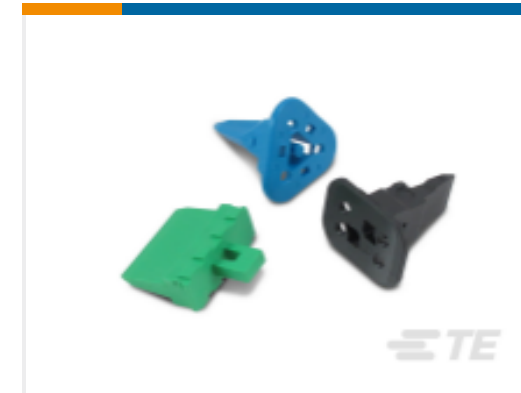
TE Part #W6P DEUTSCH DT WEDGELOCKS