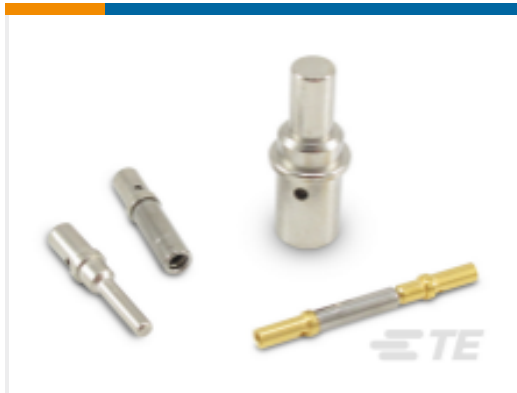
TE Part #0462-209-16141 DEUTSCH SOLID CONTACTS