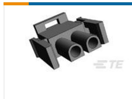
TE Part #1-480698-0 02P UMNL PLUG HSG NATL