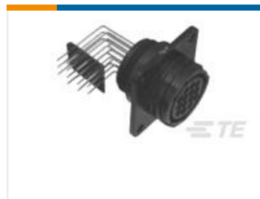
TE Part #1776904-1 CPC POSTED RCPT,17-16,R/A