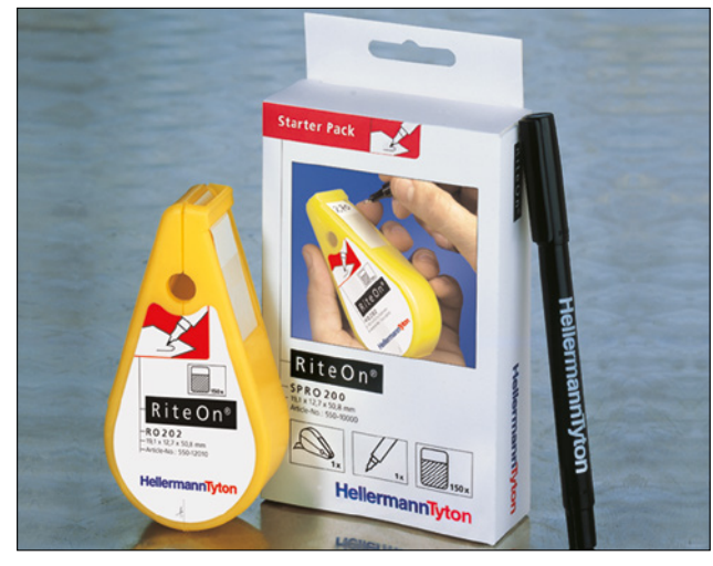
The RiteOn starter pack gets you started right away.