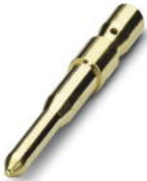
Crimp contact, turned, contact diameter: 1.5 mm, crimp range: 0.08 mm 2 ... 0.22 mm 2

Please be informed that the data shown in this PDF Document is generated from our Online Catalog. Please find the complete data in the user's documentation. Our General Terms of Use for Downloads are valid ( http://phoenixcontact.com/download )