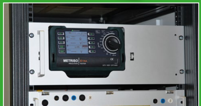
Metriso Series as 19" panel-mounting type