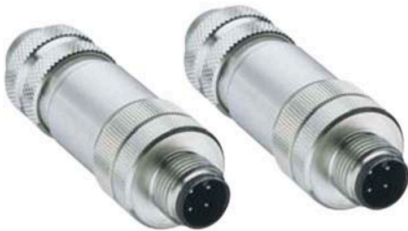
Part no.: 426128 AC-MLC-END Connector set