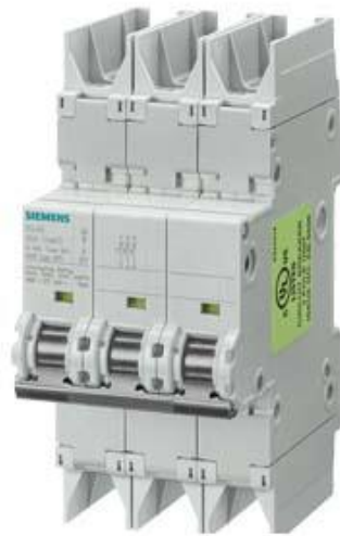
CIRCUIT BREAKER 10KA, 3POLE, D, 1.6A ACC. TO UL 489 - 480Y/277V