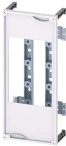
ALPHA 630 DIN, ASSEMBLY KIT F. 4-IN-LINE FUSE SWITCH DISC.N 3NJ4 SZ.00, H=600 W=250